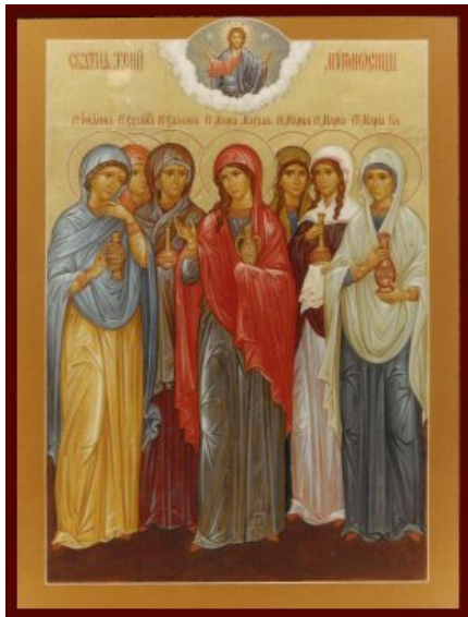
Holy Transfiguration Monastery – Brookline, MA

Luke 8:1-3; 23:55-24:11, 22-24. John 19:25; 20:11-18. Acts 1:14.) Together with them we celebrate also the secret disciples of the Savior, Joseph and Nicodemus. Of these, Nicodemus was probably a Jerusalemite, a prominent leader among the Jews and of the order of the Pharisees, learned in the Law and instructed in the Holy Scriptures. He had believed in Christ when, at the beginning of our Savior’s preaching of salvation, he came to Him by night. Furthermore, he brought some one hundred pounds of myrrh-oils and an aromatic mixture of aloes and spices out of reverence for the divine Teacher (John 19:39). Joseph, who was from the city of Arimathea, was a wealthy and noble man, and one of the counselors who were in Jerusalem. He went boldly unto Pilate and asked for the body of Jesus, and together with Nicodemus he gave Him burial. Since time did not permit the preparation of another tomb, he placed the Lord’s body in his own tomb which was hewn out of rock, as the Evangelist says (Matthew 27:60).