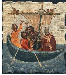
December 7, 2008

320 Munson Avenue McKees Rocks, PA 15136 A parish of the Orthodox Church in America www.stnicholas-oca.org info@stnicholas.org